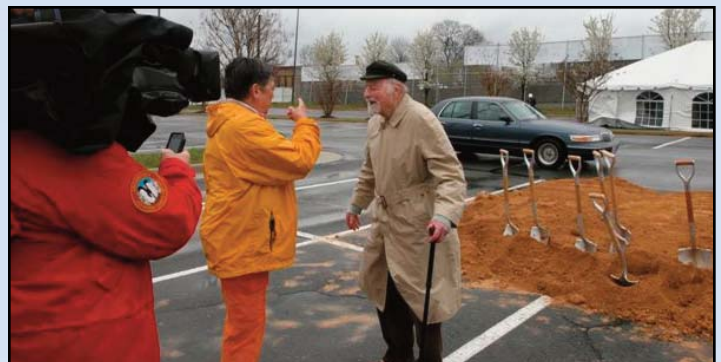
CELEBRATING: Reston founder Robert E. Simon arrives to celebrate the groundbreaking for Reston Station.

Comstock has chosen Reston Station as the name for its joint-venture development with Fairfax County. It will include the below-grade parking facility for about 2,300 cars, 10 bus bays and bicycle racks. Mixed-use residential and commercial development are also planned. More information is available at www.comstockpartnerslc.com and www.dullesmetro.com .