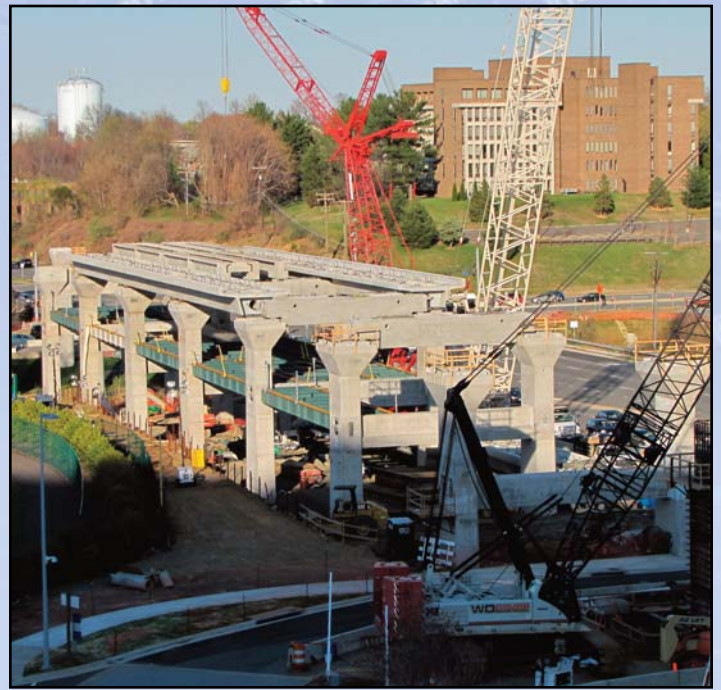
PROGRESS AT TYSONS EAST: Construction continues at the Tysons East Metrorail Station being built on the northwest side of Route 123 at the corner of Scotts Crossing Road.

For construction-related emergencies, call the Dulles Corridor Metrorail Project Hotline at 877-585-6789.