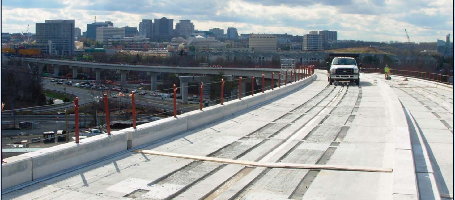
TYSONS CORNER ON THE HORIZON: Crews are continuing to prepare the bridges from the Dulles Connector Road to Route 123 for rail tracks.

The bridges that will carry the tracks for the future Dulles Corridor Metrorail Project trains from the Dulles Connector Road (Route 267) into Tysons Corner are almost complete, photographs of which provide a dramatic view of the Tysons skyline and a hint of the future of this changing economic center.