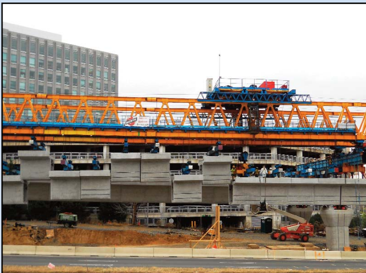
COMPLETING WORK NEAR CAPITAL ONE: This horizontal crane continues its work building bridges for rail along Route 123.