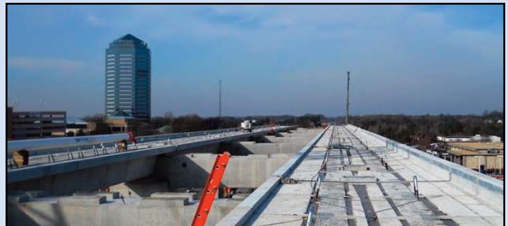
LOOKING WEST: The guideway/bridge for rail in Tysons is almost ready for track. This photo is looking westward from the Tysons West Station area with the Tysons Sheraton in the background.

The project's first Traction Power Substation and Train Control Room were moved to sites along the Dulles Connector Road and bridges were built across Magarity Road, Pimmit Run, Difficult Run and the Washington and Old Dominion Trail.