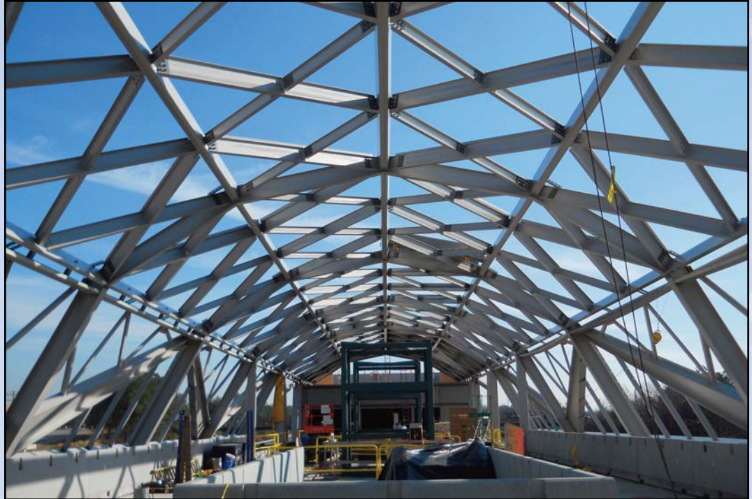
INTO THE SKY AT WIEHLE: Dulles Metrorail crews erect the structural steel canopy on the mezzanine at the Wiehle Avenue Station under construction in the median of the Dulles Airport Access Highway/Dulles Toll Road corridor.