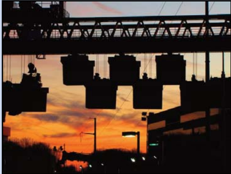
CREATING A BRIDGE: Concrete segments being hoisted into place along Route 7 are creating a bridge for rail in the median of Route 7 in Tysons Corner.

Here are some details. Mining and concrete operations for the in-bound and out-bound tunnels connecting the Tysons Central 7 and Tysons Central 123 stations were completed earlier this year and track will soon be put in place. These twin tunnels run beneath the highest natural point in Fairfax County at the intersection of Routes 7 and 123.