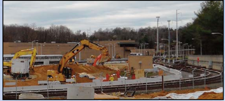
PROGRESS AT THE WEST FALLS CHURCH YARD: Crews complete jack-and-bore crossings for the Service and Inspection building.

For construction-related emergencies, call the Dulles Corridor Metrorail Project Hotline at 877-585-6789.