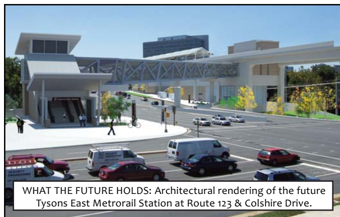
WHAT THE FUTURE HOLDS: Architectural rendering of the future Tysons East Metrorail Station at Route 123 & Colshire Drive.

The project is being managed by the Metropolitan Washington Airports Authority ( www.mwaa.com ).