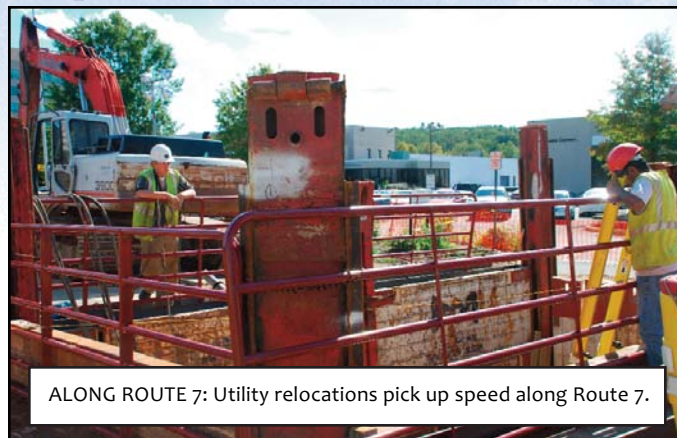
ALONG ROUTE 7: Utility relocations pick up speed along Route 7.

For more information on the Dulles Corridor Metrorail Project, please visit our website at www.dullesmetro.com or call (703) 572-0506.