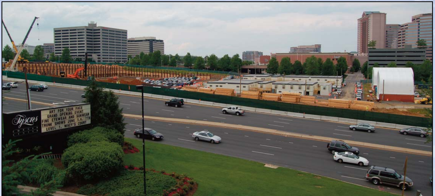
CONSTRUCTION HEADQUARTERS: Construction work begins for a tunnel that will take the rail line from Route 123 to Route 7 as seen from atop a parking garage at Tysons Corner Center. Tysons Galleria is in the background at right.