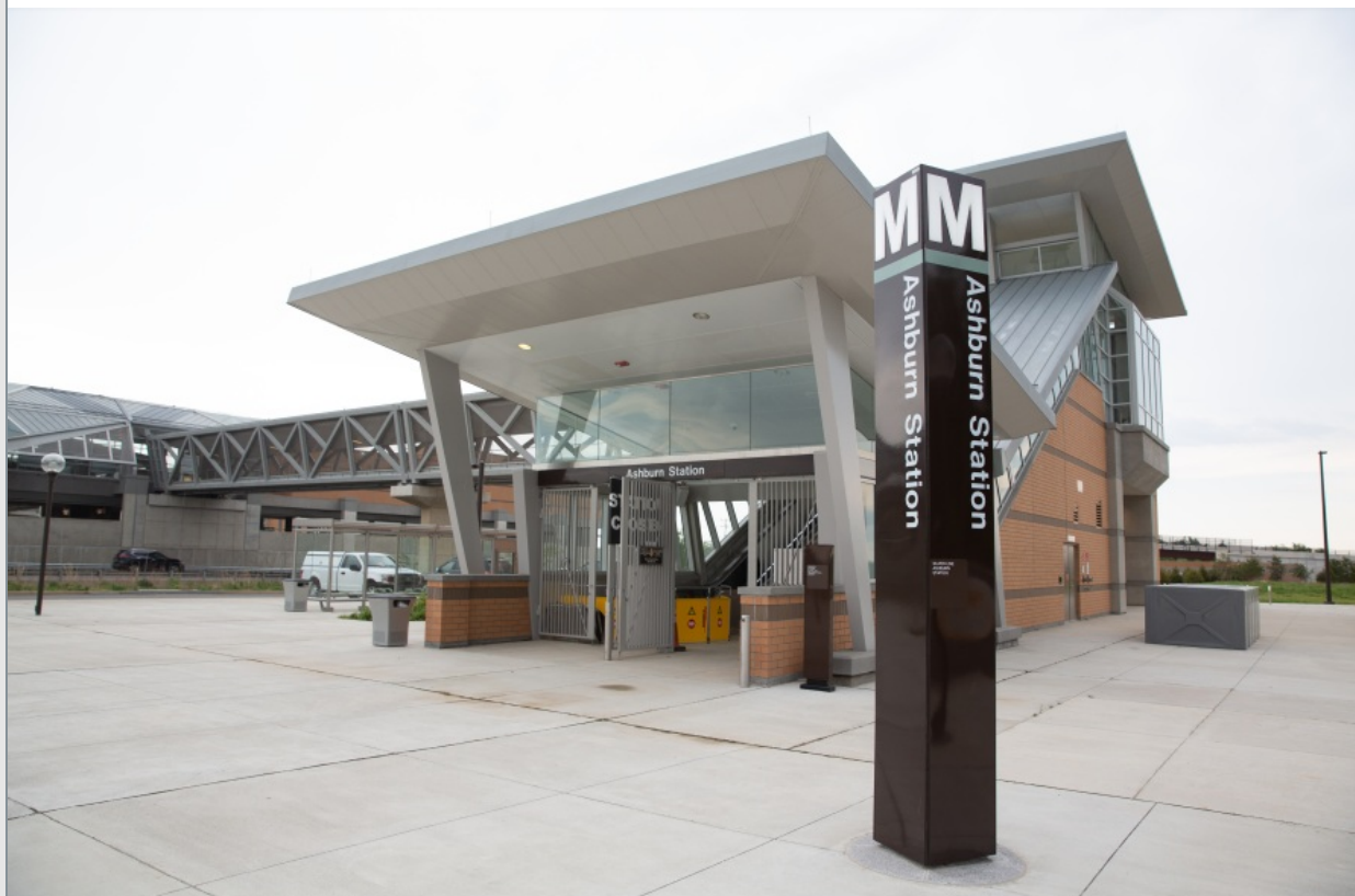
The south pavilion at Ashburn Station, which will serve as a focal point for Moorefield, a community currently under development south of the the station. Phase 2 of the Silver Line is expected to open next year.

Besides the garages, each station offers bicycle racks and lockers near both the pavilion as well as bus bays, kiss-and-ride lots and public restrooms.