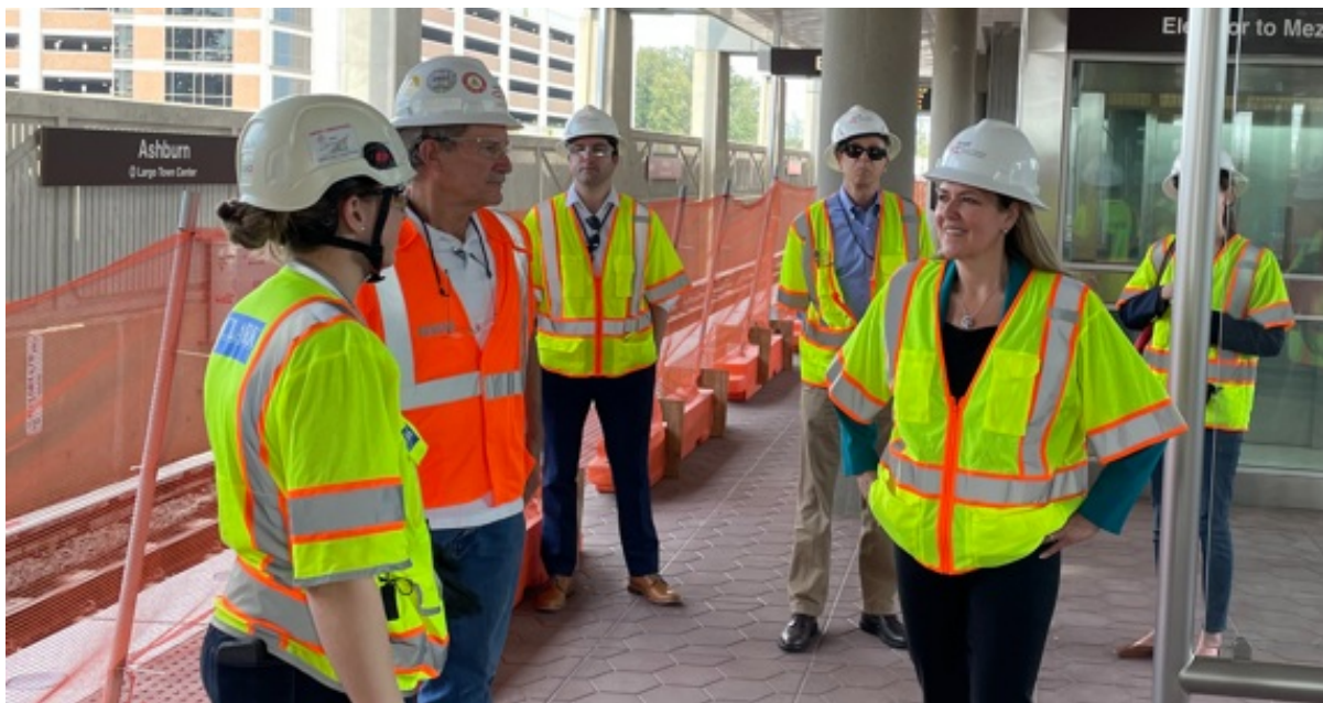
Congresswoman Jennifer Wexton learns about Phase 2 progress during a tour this summer. Above, everyone is standing beneath the vaulted canopy, which you see in the background below.

The Airports Authority's rail project team will review the results of the October testing as soon as possible after the connections are completed. The next step will be the contractor's declaration of having reached substantial completion, which will then be reviewed by the Airports Authority. If accepted, the next step will be to turn the project over to WMATA.